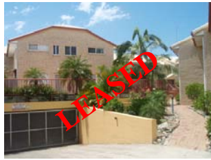
Bundilla Blvd, Mtn Creek $300.00 p/w