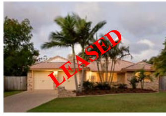
Redwood Court, Currimundi $475.00 p/w