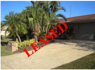
Kalana Road, Aroona $400.00 p/w