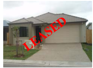
Stavewood St, Meridan Plains $400.00 p/w

Office: 07 5437 8806 | Mobile: 0409 378 806 | Email: eliza@henzellsplatinum.com.au